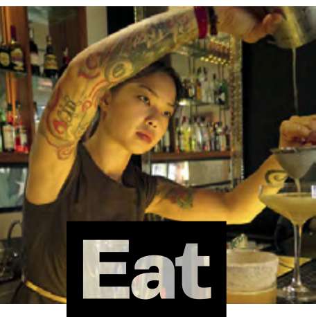
Clockwise from left: Shake it up at Hit & Mrs.; dining at Old China Café; Barlai is in a converted house; homemade crab pasta at perennial favorite Nerovivo.